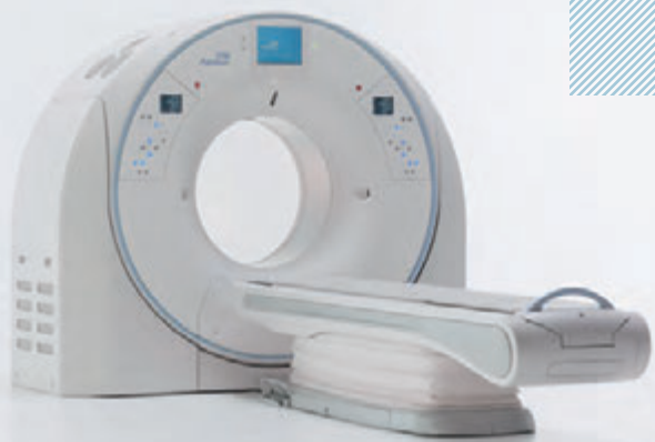
Canon's Aquilion ONE GENESIS Edition - Dynamic Volume CT